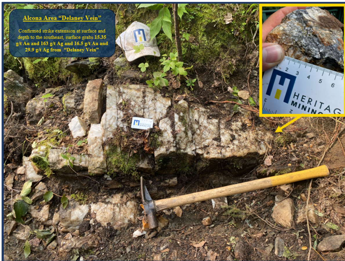
Figure 2 – Alcona Area ‘Delaney Vein’